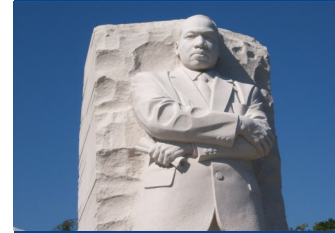
Martin Luther King, Jr. National Memorial