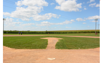
Field of Dreams Ghost Tour